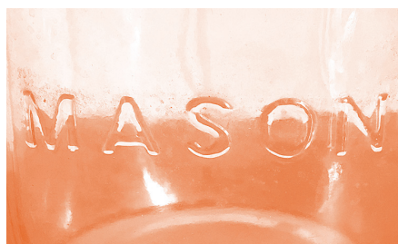
EASI PAK MASON JAR, KNOX GLASS COMPANY