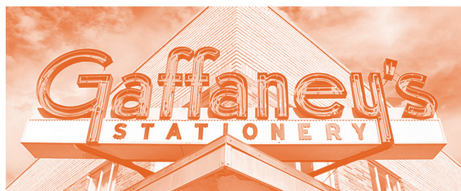
GAFFANEY'S STATIONERY SIGN, WILLISTON, ND, DESTROYED BY FIRE IN 2013

In 2011 I was an in-house designer at a large accounting firm working on a corporate redesign. Among my short-list of recommended typeface suggestions were the ATF 1 staples Franklin Gothic and News Gothic 2 , Trade Gothic 3 , and newer, more contemporary American sans serifs such as Alright Sans 4 , Gotham 5 , and Proxima Nova 6 . While I liked all of the typefaces I was considering, there were certain elements about each one I wasn't entirely happy with. The more modern fonts felt better, but gosh, I really missed the two-story gs in the old gothics. On the other hand, those old gothics had a lot of personality, but at the same time they could feel too retro or vintage. I wanted a hybrid. Proxima Nova came the closest but was still too rigid, too geometric, for what I had